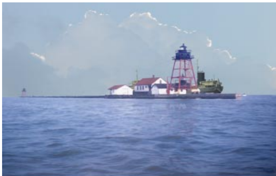
Toledo Harbor Crib Light 1950's